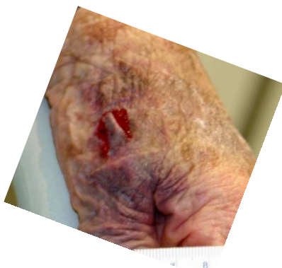
Skin tear in a wound clinic patient