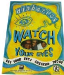
Diabetics - Watch your eyes

"Get Your Eyes Checked Today" 3 titles in full colour, A3 size $2.00 each inc GST