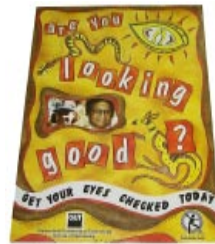
Are you looking good?