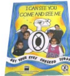
I can see you - come and see me